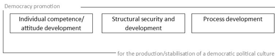
Fig. 1: Conceptual levels of democracy promotion